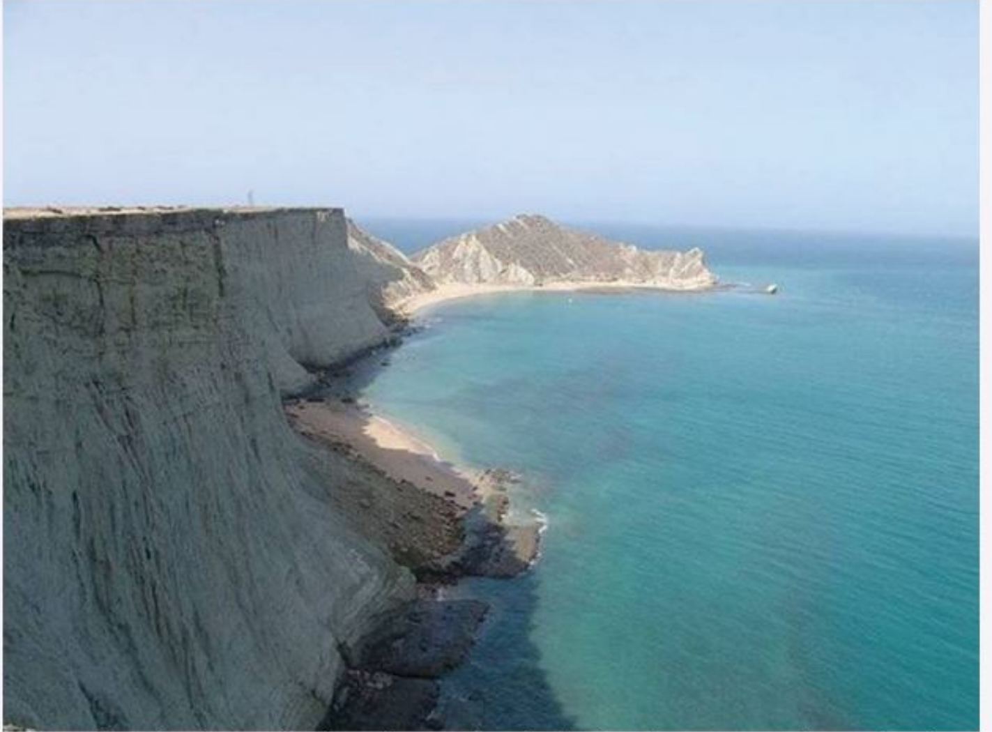
8) Astola Island, Gwadar/Pasni - Astola Island, also known as Jezira Haft Talar Satadip or 'Island of the Seven Hills', is a small uninhabited Pakistani island in the Arabian Sea. Also the largest island in Pakistan, it is the epitome of Balochistan's undermined beauty.