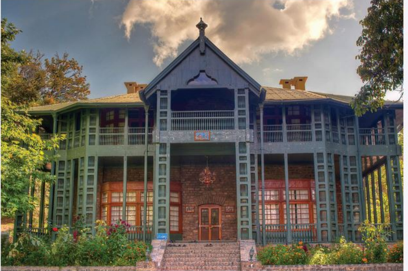
4) Quaid-e-Azam Residency, Ziarat - Father of Pakistan, Quaid-e-Azam Mohommad Ali Jinnah spent his days of affliction in this wooden cottage in Ziarat, Balochistan.