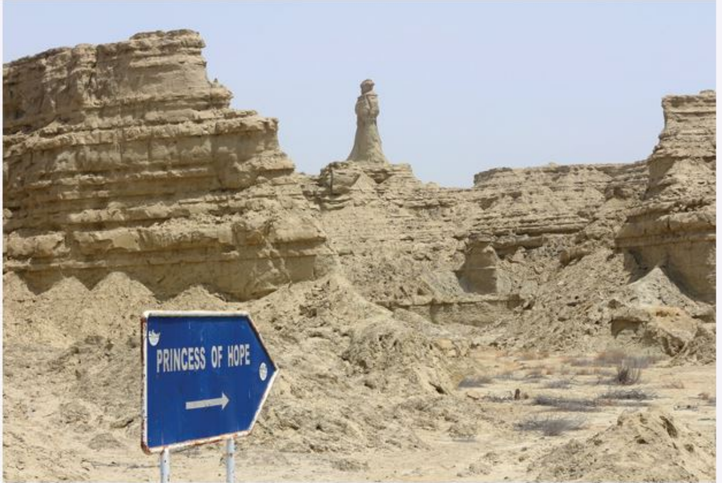
6) Princess Of Hope, Gwadar - The Princess Of Hope is a 740 year old mountain near Gwadar, along the Makuran Coastal Highway. A spectacular view of its own!