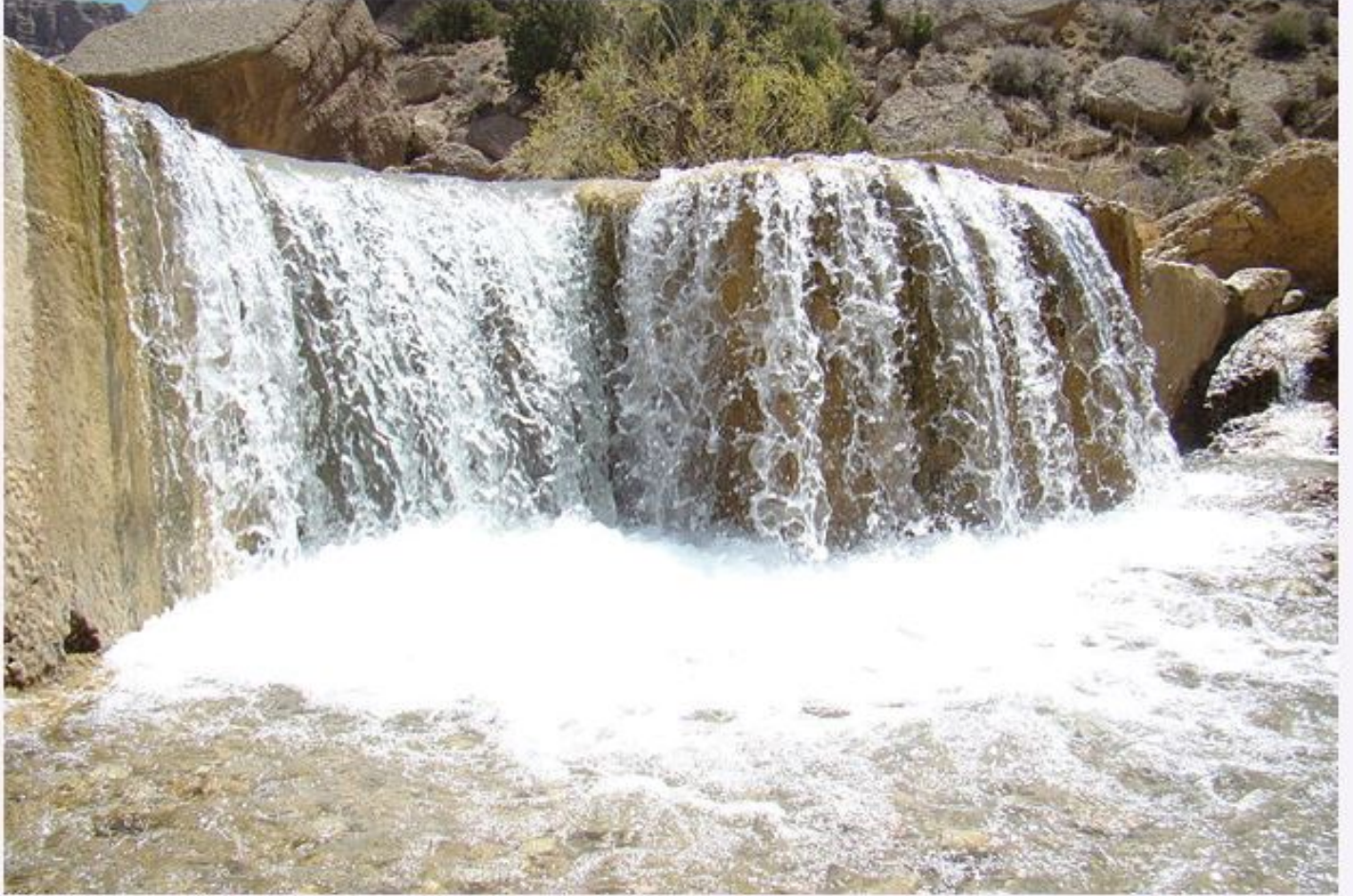
7) Urrak Falls, Quetta - The Urrak falls are known as the younger sister to the Hannah Jheel. Mentioned together as Hannah Urrak, Urrak is a fathomable vacation spot for people of Quetta and around. Fresh water and good weather.