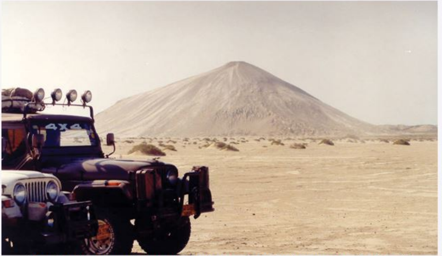
2) Mud Volcanoes, Hingol - These deserted Mud volcanoes can be found in different regions of Balochistan. This particular one rests in Hingol, Balochistan.