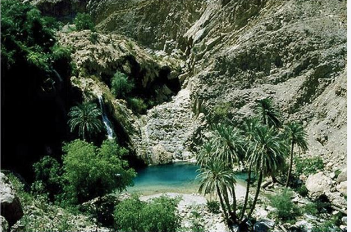
5) Pir Ghaib Falls, Bolan - This is an awe-inspiring view of Pir Ghaib, Balochistan. Locals here believe in the myth of the Invisible Saint (Pir Ghaib), who was saved by the Almighty.