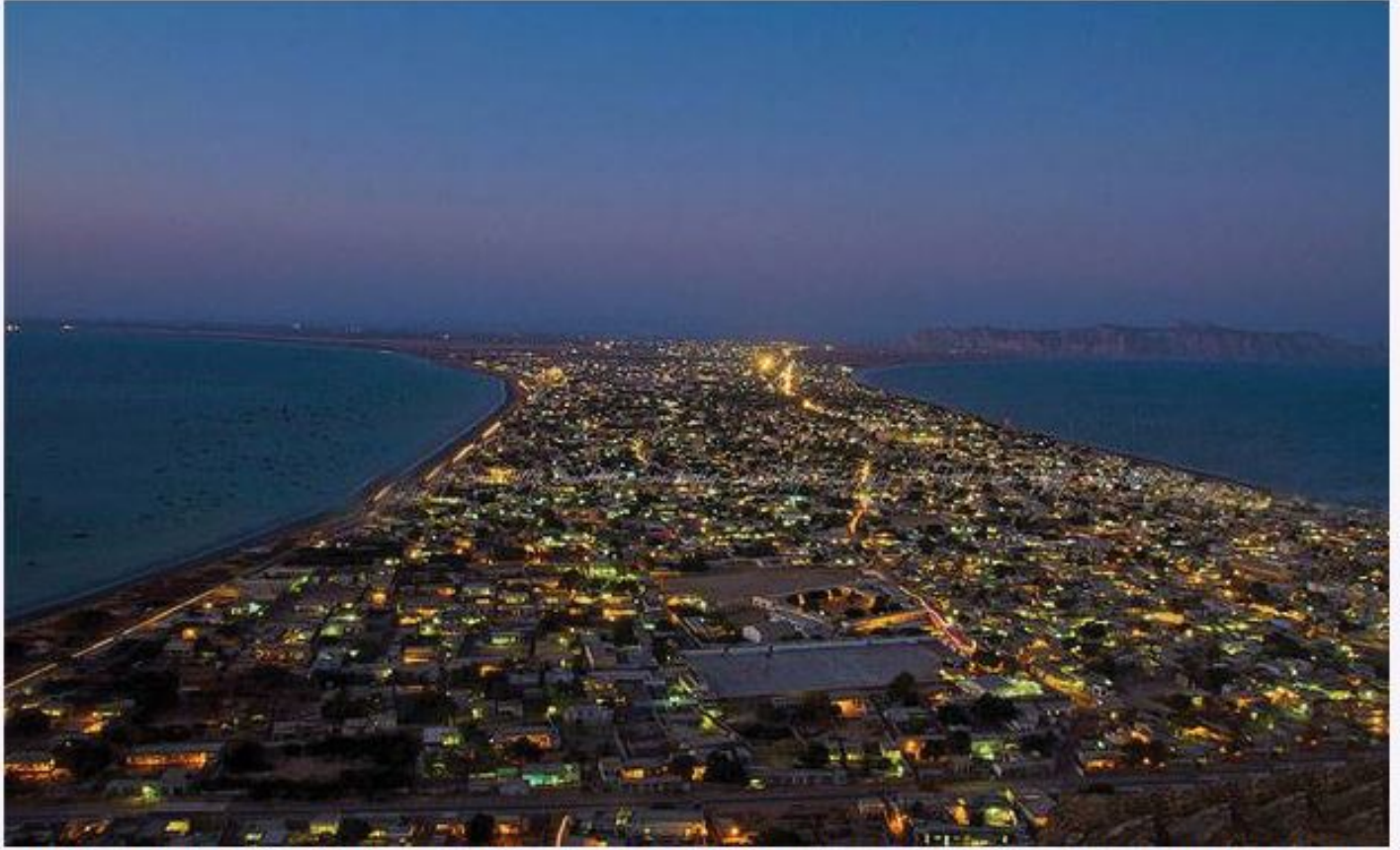
9) The City of Gwadar - A city separated by the sea at both ends. Gwadar has the potential to be the trade hub of Pakistan. It is not just resourceful – also is breathtakingly beautiful.