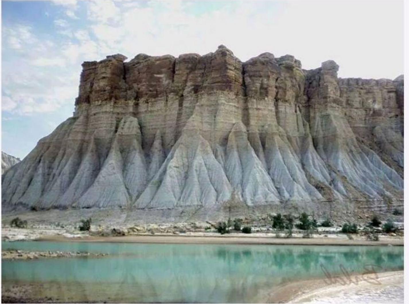
12. Hingol, Lasbela