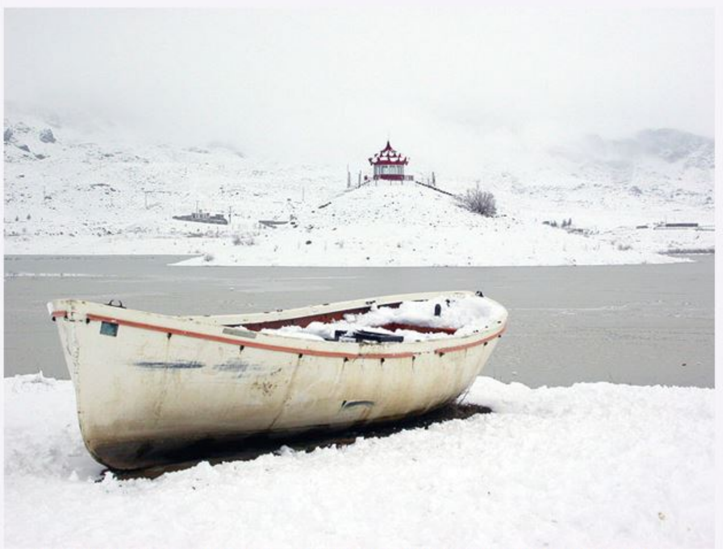
1) The Hannah Jheel, Quetta - This is how the Hannah Lake looks in winters. Frozen, frosted and astounding. This is where Quetta's escapes rest.