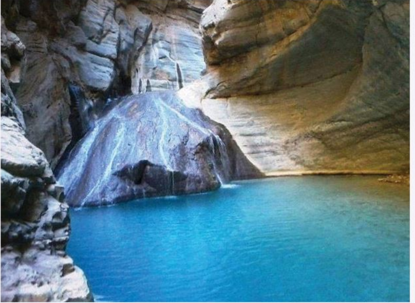
3) Moola Chotok, Khuzdar - This tourism deprived sight is known as Moola Chotok in Khuzdar, Balochistan. Amidst stronghold of nationalists in the Jhalawan belt, Chotok seems like a lost cause.